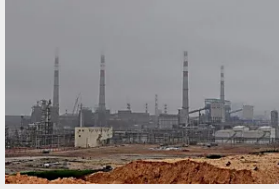
Steel, resource shares gain on Chinese winter output cuts