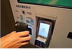
Exclusive: Alibaba to cash in on Japan's nascent e-payment market