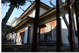
Japan looks to put more abandoned property to use