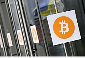
As bitcoin storm brews, exchanges ready to close shutters