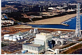
Obstacles grow for coal power in Japan